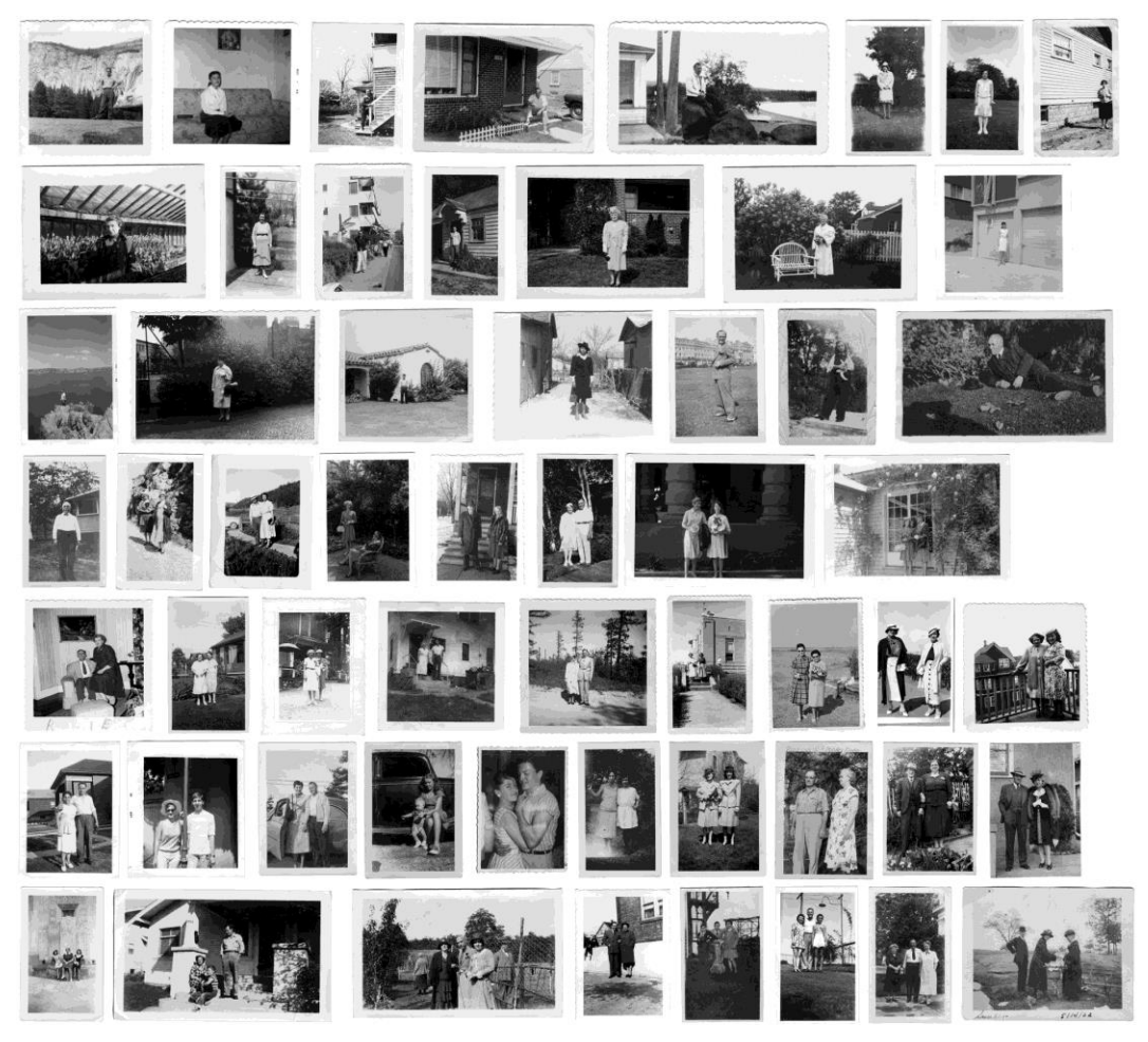
Figure 2 Example of non-competitive (or "home mode") photography. Montage of anonymous found family photographs from the collection Look at Me (http://look-at-me.tumblr.com). Thumbnails are displayed in ascending order according to the number of persons in the photographs starting from top left.