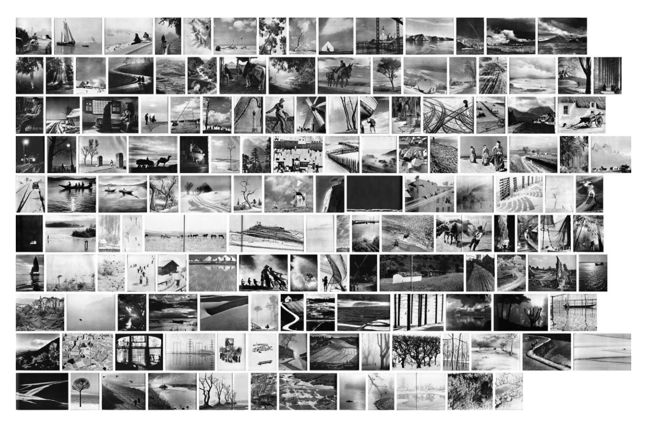
Figure 1 Example of competitive photography. Montage of all landscape and nature-related photographs from the catalogs of the first seven biannual photography exhibitions organized by the International Federation of Photographic Art (1952–1964). Thumbnails are organized in chronological order starting from top left.

photography exhibitions (1952–1964) clearly shows a strong preference for expressive geometric shapes (Fig. 1).